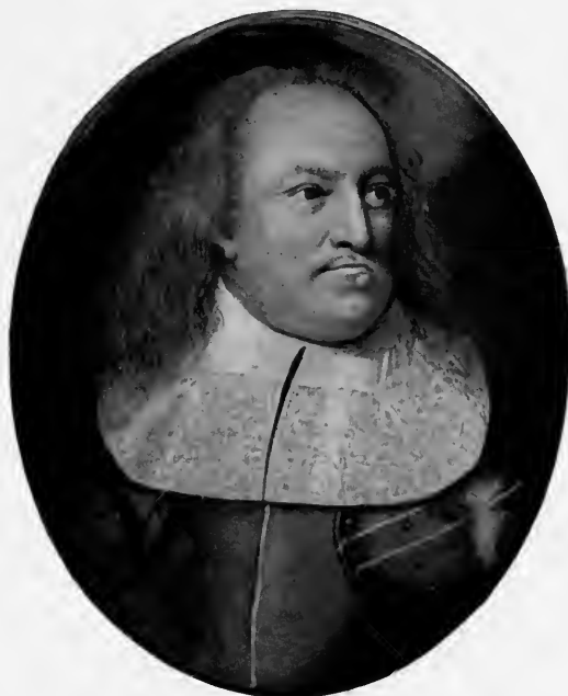
JOHN, EARL OF LOUDOUN (1598-1662) BY SAMUEL COOPER